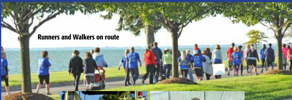
Runners and Walkers on route