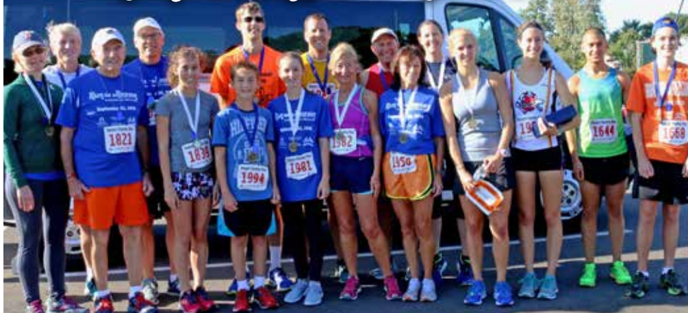
Run for a Reason 5K Winners!